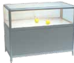
SH-C1 Glass Display Case (1/3 view) 48" W x 24" D x 36" H