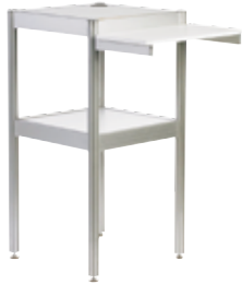
601 Computer Stand 41" H