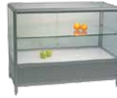
SH-C2 Glass Display Case (Full view) 48" W x 24" D x 36" H