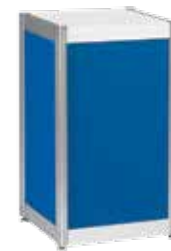
802 20" Square Pedestal 36" H

*Sold as individual panels. Can be attached together in many configurations.