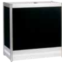
803 Counter Storage Unit 41" H x 41" W x 20" D