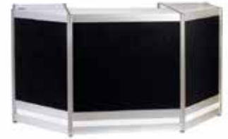
801 U-Shaped Counter, open back 41" H