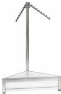
701 Bag Stand Holder