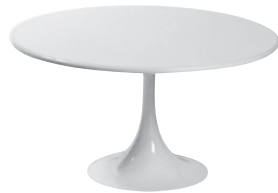
105 Round White Ped Table 18" H