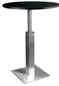
C-CRU-1 Bistro Table, black top, aluminum base 30" diameter