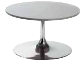
120 Round Ped Table, grey top, chrome stand 18" H