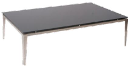
C-CT-4 Black Glass Coffee Table, steel frame 24" x 48"