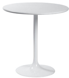
104 Round White Ped Table 30" H