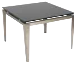
C-ET-5 Black Glass End Table, steel frame 24" x 24"