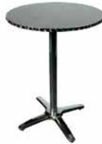
C-CRU-10 Round Brushed Aluminum Table, laminate top 30" diameter