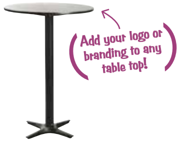
111 Bistro Table, black 30" diameter