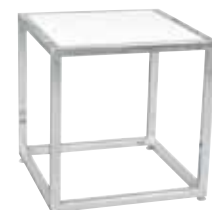
C-ET-10 Chrome End Table, square, white plexi 18" x 18"