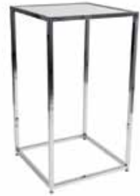
C-CRU-3 Chrome Table, white plexi top 24" x 24" sq.