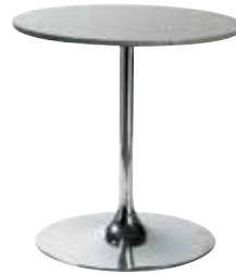
119 Round Ped Table, grey top, chrome stand 30" H